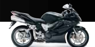
Pearl Cosmic Black

Honda machines sold in your area are those most suited to local conditions. Specifications, appearance and availability may differ depending on markets, and are subject to change without notice. For details, please consult your nearest Honda dealer.