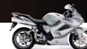
Digital Silver Metallic