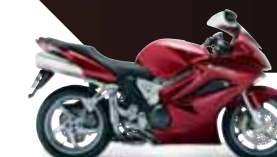
Candy Glory Red