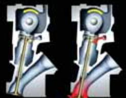
VTEC disabled VTEC enabled

Advanced V4-VTEC Engine - Unique 782cm 3 fuel-injected DOHC V4 engine with a unique two-stage VTEC valve actuation system provides a seamless and even spread of satisfying power.